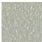
Métal gris claire