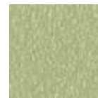
Métal vert sauge