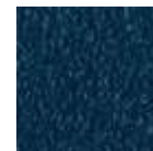
Métal bleu ocean